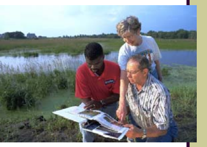
NRCS Planner reviewing conservation alternatives in the field with land managers.